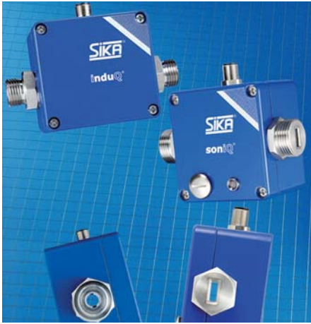
Flow Sensors without moving Parts