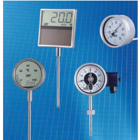
Electronic Digital Thermometers, Dial Thermometers