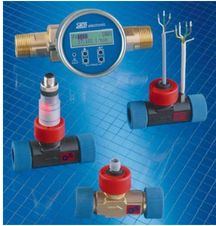
Turbine Flow Sensors