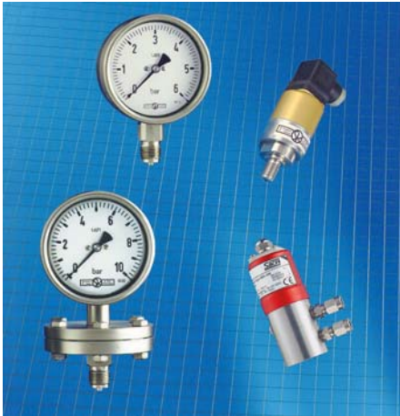
Pressure Gauges and Pressure Sensors